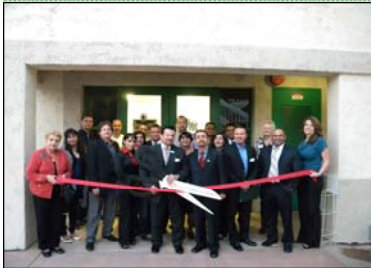
Prudential California Realty-Mulhern Group